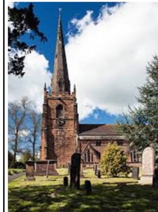
St. Mary & St. Chad Brewood